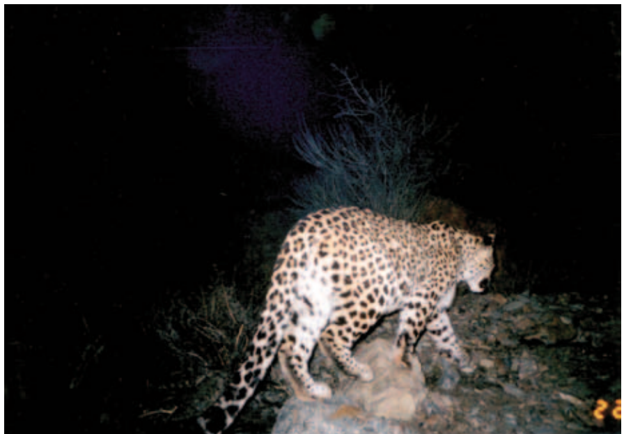
Fig.2. An adult female in Sarigol National Park in March 2007 (Photo Iranian Cheetah Society).

SNP is surrounded by around 20 villages and the city of Esfarayen. As the first stage, it was considered essential to prepare a baseline composed of socio-economic data on the circumstances of local communities. The baseline was later used to identify the most relevant targets and stakeholders and their needs. Also, research was carried out in the area and nearby cities to identify NGOs that could be involved in data gathering and so make public awareness efforts more effective. Their capacity for partnership in a local participatory approach was evaluated according to their