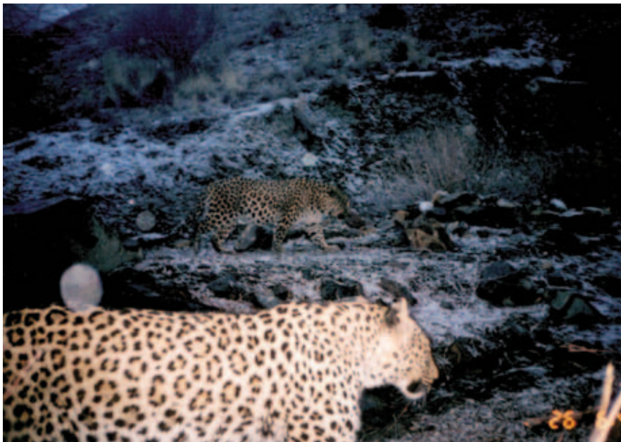
Fig. 3. A pair of Persian leopards during the mating season in February 2007 in Sarigol National Park (Photo Iranian Cheetah Society).